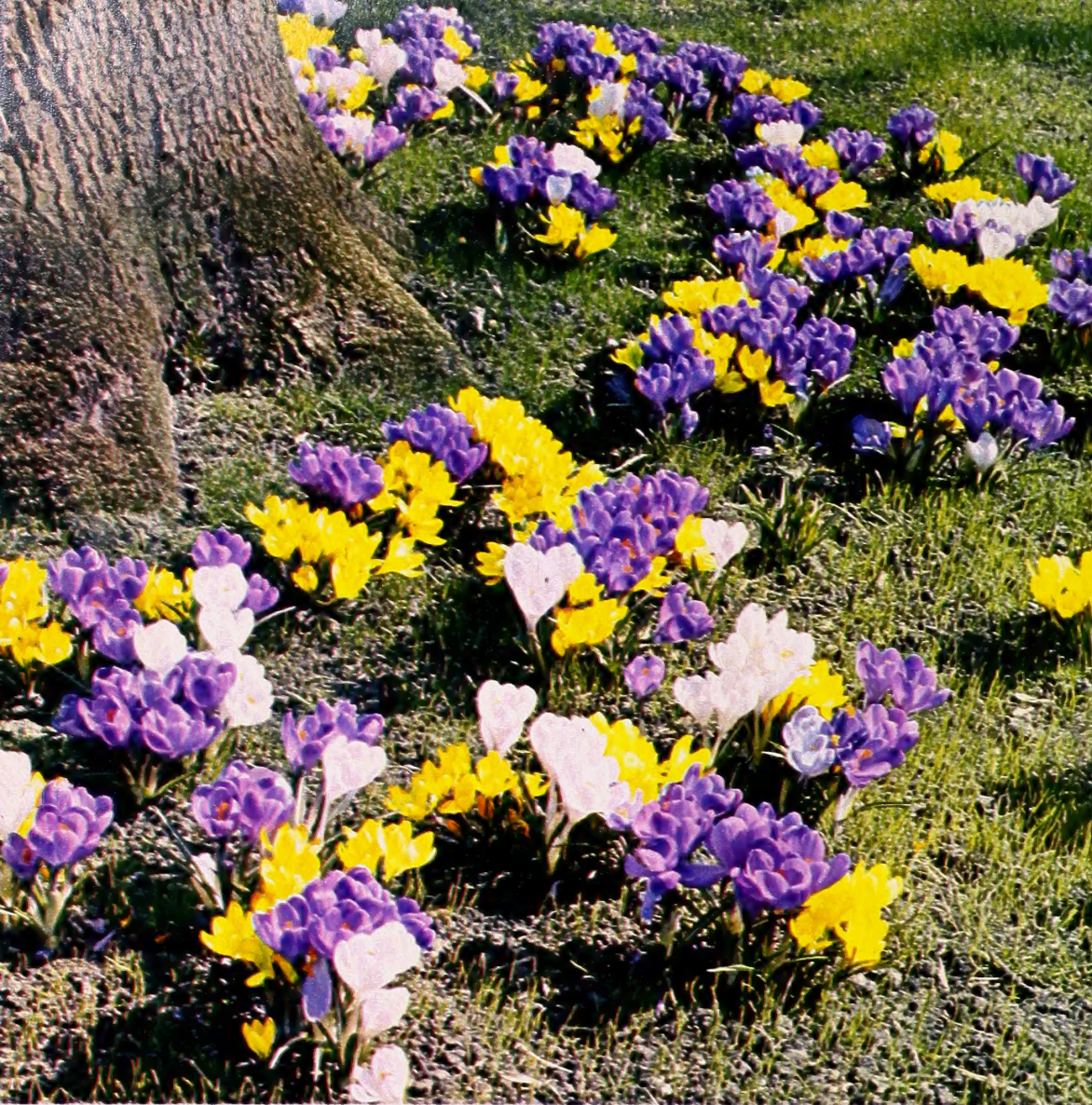
39 Crocus are happy flowers in the garden. Perky and pert they greet the new season with a burst of color. Plant them in the lawn. They will flourish if the foliage is allowed to ripen and die down before the area is mowed. Returning each Spring as a welcome sight, crocus belong in every garden.